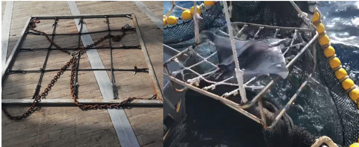
Figure 1. Sorting grid (left) and a mobulid released using the sorting grid (right).

To define and test safe-handling and release best practices for mobulid rays, including the development of BRDs and gear modification, 12 sorting grids designed by AZTI were constructed for each of the 12 participating purse seine vessels (Figure 1). For this activity, scientists from UCSC and AZTI monitored sorting grid use on board purse seine vessels, during three trips. During those trips, scientists (i) evaluated the efficacy and time of release of mobulids using sorting grids or another release method (i.e., stretchers, manual, etc.) and (ii) evaluated post-release mortality using survivorship tags (sPAT tags). Fishers also evaluated the efficacy of the sorting grid during the fishing operation by filling out a form specifically designed for the project.