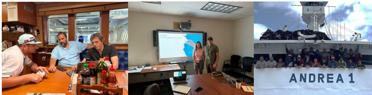
Figure 3. Project scientists training fishers on board purse seiners for mobulid tagging, sampling, and testing the sorting grid.

Finally, one of the key objectives of the project is to educate and raise fishers' awareness on mobulid conservation, train them on mobulid species identification, tissue collection and tagging (Figure 3). In person and online meetings were held with fishers as well as onboard purse seiners during port visits (e.g., Pago Pago, Manta). Generally, fishers demonstrated interest in improving handling practices and contributing to mobulid conservation, which will likely make it easier to implement better bycatch release practices in the long term.